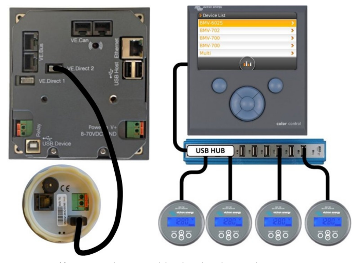
A maximum of four BMVs can be connected directly to the Color Control. Even more BMVs can be connected to a USB Hub for central monitoring.

Data can be stored and analyzed on the VRM Portal. iPhone and Android apps are available for monitoring and control.