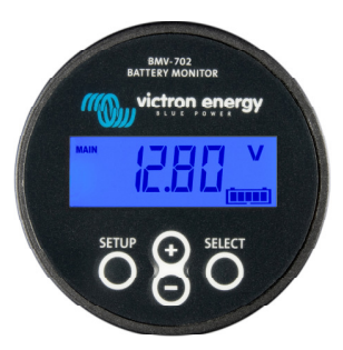
BMV 702 Black